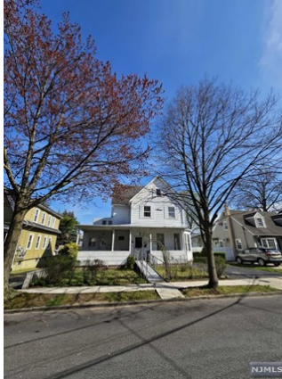
large two family